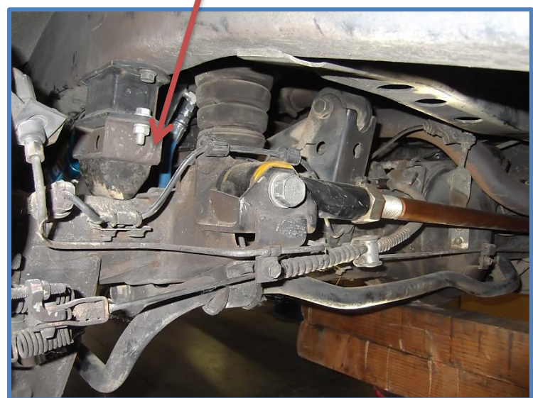
IMPORTANT: Read all instructions thoroughly from start to finish before beginning the install. Check parts list and make sure all parts are included in the kit. If the instructions are not properly followed severe frame, driveline and/or suspension damage may result. Check for frame and suspension damage prior to installation.