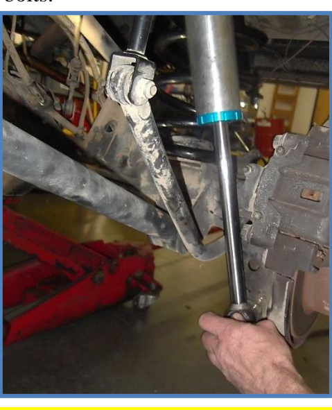
IMPORTANT: Read all instructions thoroughly from start to finish before beginning the install. Check parts list and make sure all parts are included in the kit. If the instructions are not properly followed severe frame, driveline and/or suspension damage may result. Check for frame and suspension damage prior to installation.