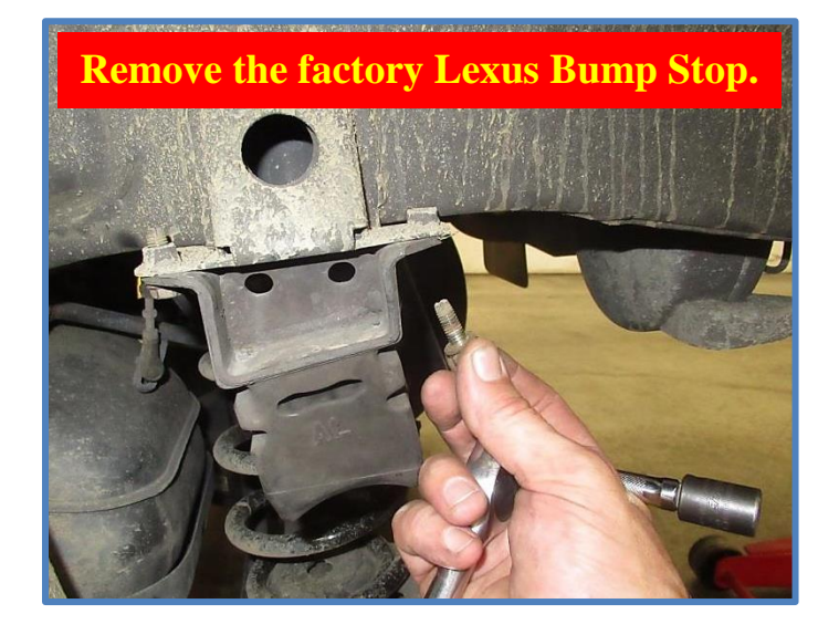
Replace Lexus factory bump stop with a 4Runner or FJ factory bump stop.

• You must also remove the factory bump stop and replace with a factory style 4Runner or FJ Cruiser bump stop. Failure to modify the bump stop will reduce available wheel travel and cause the rear axle to bottom out prematurely on the factory bump stops that were designed to work with the air bags.