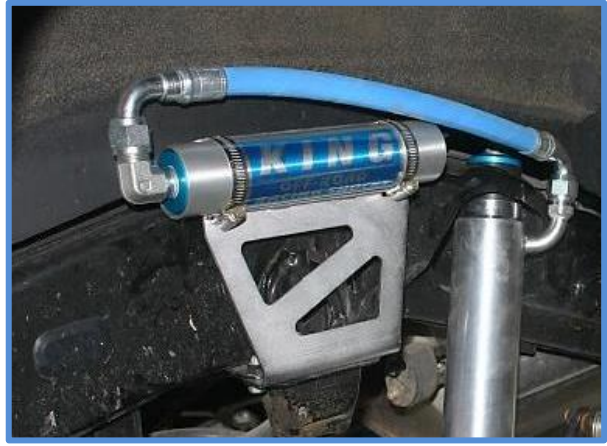
Double check all hardware, install tires and lower the vehicle. Check all hardware and lug nuts after 100 miles and periodically after that as part of routine maintenance.

IMPORTANT: Read all instructions thoroughly from start to finish before beginning the install. Check parts list and make sure all parts are included in the kit. If the instructions are not properly followed severe frame, driveline and/or suspension damage may result. Check for frame and suspension damage prior to installation.