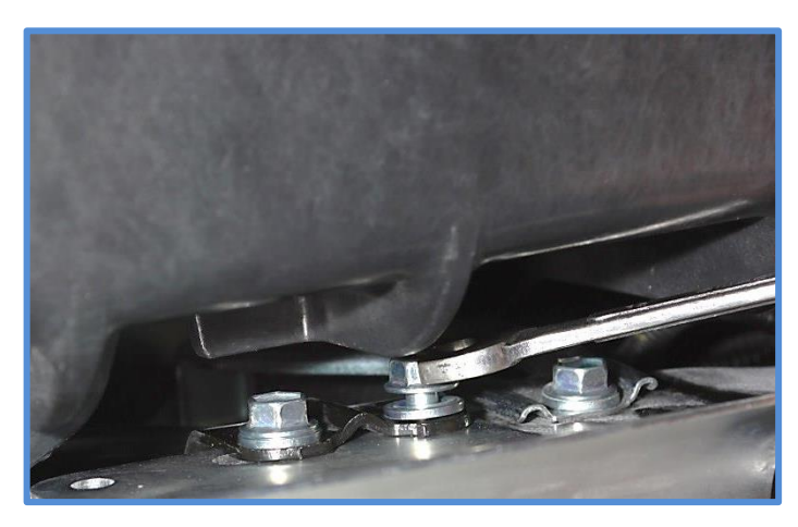
IMPORTANT: Read all instructions thoroughly from start to finish before beginning the install. Check parts list and make sure all parts are included in the kit. If the instructions are not properly followed severe frame, driveline and/or suspension damage may result. Check for frame and suspension damage prior to installation.