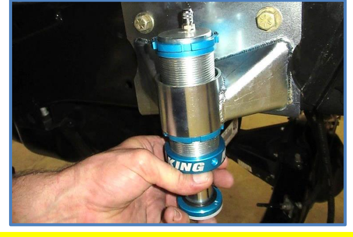
IMPORTANT: Read all instructions thoroughly from start to finish before beginning the install. Check parts list and make sure all parts are included in the kit. If the instructions are not properly followed severe frame, driveline and/or suspension damage may result. Check for frame and suspension damage prior to installation.