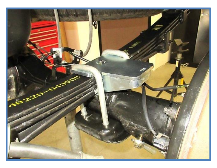
IMPORTANT: Read all instructions thoroughly from start to finish before beginning the install. Check parts list and make sure all parts are included in the kit. If the instructions are not properly followed severe frame, driveline and/or suspension damage may result. Check for frame and suspension damage prior to installation.