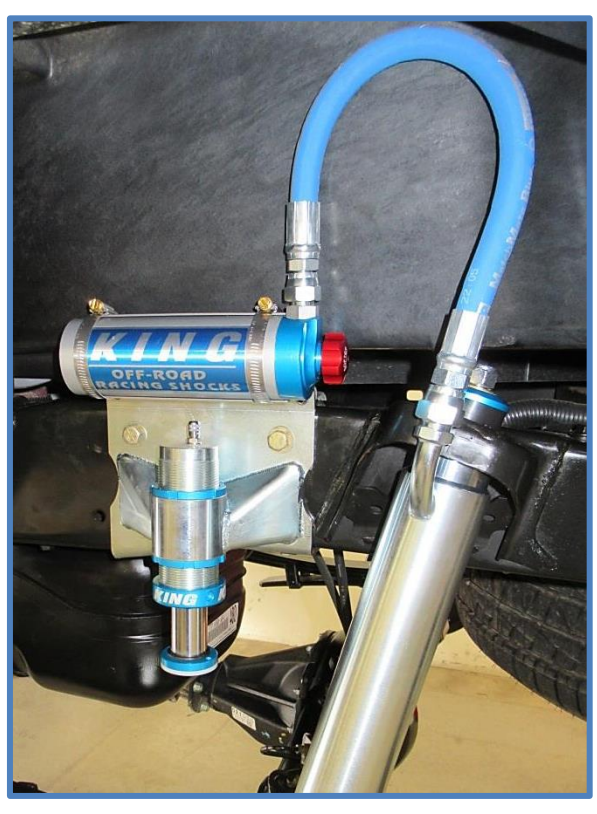
IMPORTANT: Read all instructions thoroughly from start to finish before beginning the install. Check parts list and make sure all parts are included in the kit. If the instructions are not properly followed severe frame, driveline and/or suspension damage may result. Check for frame and suspension damage prior to installation.