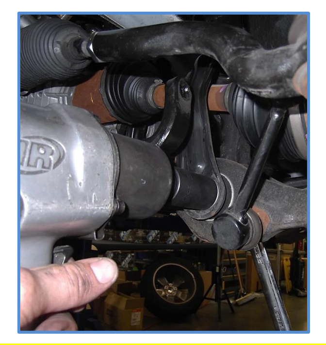
IMPORTANT: Read all instructions thoroughly from start to finish before beginning the install. Check parts list and make sure all parts are included in the kit. If the instructions are not properly followed severe frame, driveline and/or suspension damage may result. Check for frame and suspension damage prior to installation.

This kit does not require welding. Do not weld on any component. Welding may void the warranty and/or cause the product to fail. If any parts are missing, or for tech assistance; Contact King Off Road Racing Shocks: 714-530-8701 Most important after the install, Feel the difference and have fun.