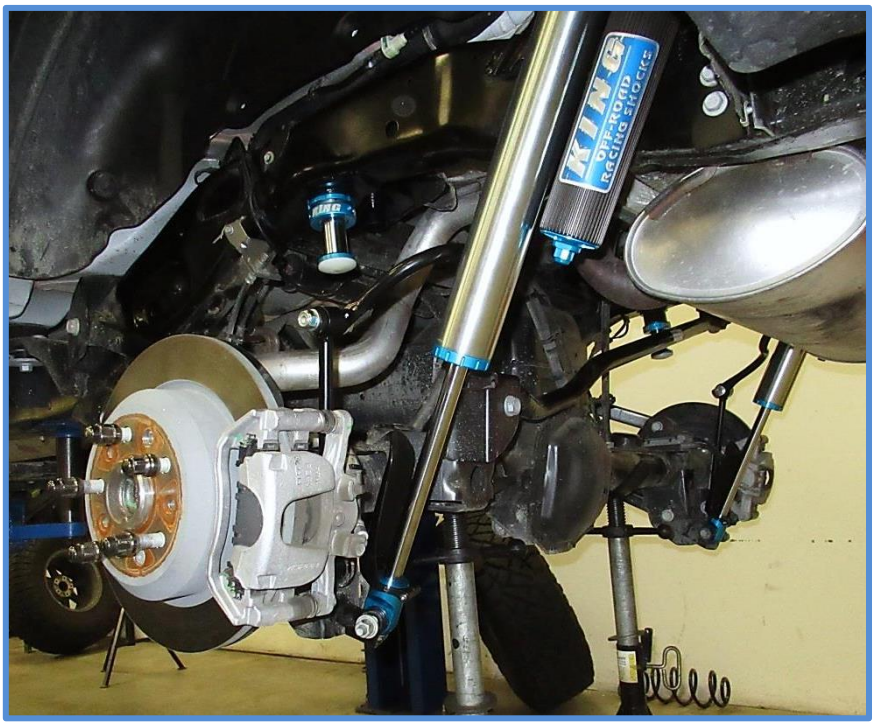
Photo below shows the suspension bottomed out with shocks installed and bump stops properly adjusted.

Photo to the right shows the rear suspension completely assembled without the springs installed. Jack the axle up until the shocks are bottomed out, and then adjust bump stops so they bottom out before the shocks do. You should have a 1/4" or more of the shock shaft showing when the bump stop is bottomed out. You will want to articulate the suspension after the install with the tires you'll be using to check for tire clearance and proper bump stop setup.... Adjust if necessary. Now is also a great time to check all suspension components for clearance issues while cycling the suspension.