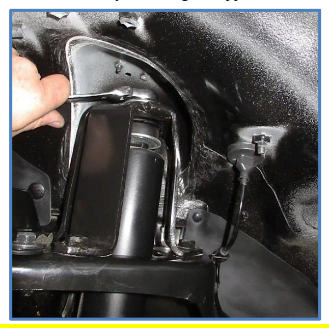
IMPORTANT: Read all instructions thoroughly from start to finish before beginning the install. Check parts list and make sure all parts are included in the kit. If the instructions are not properly followed severe frame, driveline and/or suspension damage may result. Check for frame and suspension damage prior to installation.