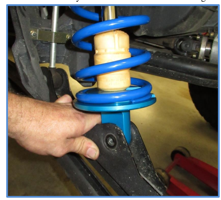
IMPORTANT: Read all instructions thoroughly from start to finish before beginning the install. Check parts list and make sure all parts are included in the kit. If the instructions are not properly followed severe frame, driveline and/or suspension damage may result. Check for frame and suspension damage prior to installation.

5. Install the factory bolt in the lower mount. Now tighten upper and lower mounting bolts to factory specs.