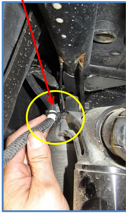
IMPORTANT: Read all instructions thoroughly from start to finish before beginning the install. Check parts list and make sure all parts are included in the kit. If the instructions are not properly followed severe frame, driveline and/or suspension damage may result. Check for frame and suspension damage prior to installation.

This kit does not require welding. Do not weld on any component. Welding may void the warranty and/or cause the product to fail. If any parts are missing, or for tech assistance; Contact King Off Road Racing Shocks: 714-530-8701 Most important after the install, Feel the difference and have fun.