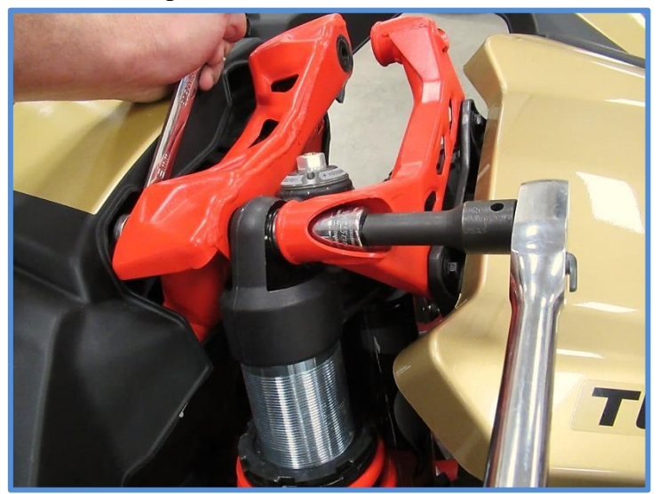
King Shocks should be mounted with reservoirs facing outward for easier access to compression adjusters and Schrader valve. This also allows more air flow to the reservoirs for better heat dissipation and maximum performance.

3. Fender trimming is required to mount front shocks. Installing shocks without springs and lowering the vehicle as you are trimming is the best way to make accurate cuts, trim plastic in stages as you lower the vehicle to the fully compressed position. See photos below and on next page for trimming example.