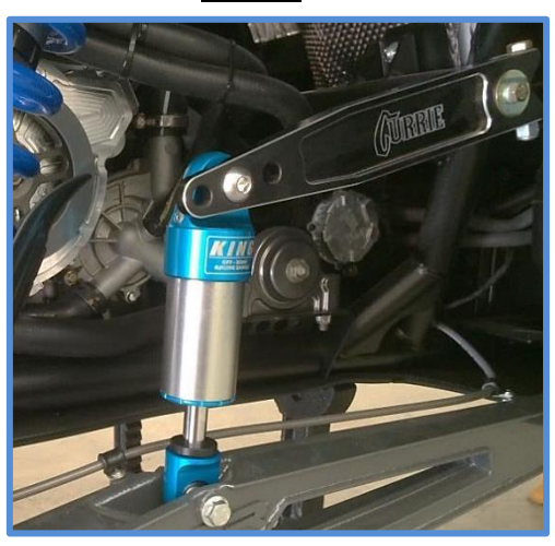
Double check your install, make sure the shocks are mounted properly and all hardware is tight. Recheck the hardware after 50 miles and periodically after that as part of routine maintenance.

IMPORTANT: Read all instructions thoroughly from start to finish before beginning the install. Check parts list and make sure all parts are included in the kit. If the instructions are not properly followed severe frame, driveline and/or suspension damage may result. Check for frame and suspension damage prior to installation.