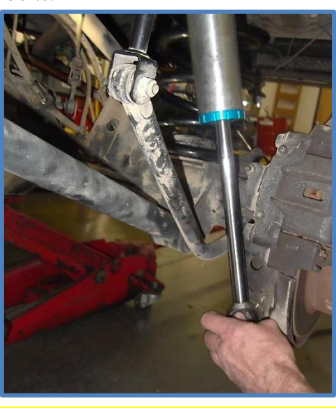
IMPORTANT: Read all instructions thoroughly from start to finish before beginning the install. Check parts list and make sure all parts are included in the kit. If the instructions are not properly followed severe frame, driveline and/or suspension damage may result. Check for frame and suspension damage prior to installation.