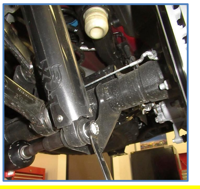
IMPORTANT: Read all instructions thoroughly from start to finish before beginning the install. Check parts list and make sure all parts are included in the kit. If the instructions are not properly followed severe frame, driveline and/or suspension damage may result. Check for frame and suspension damage prior to installation.