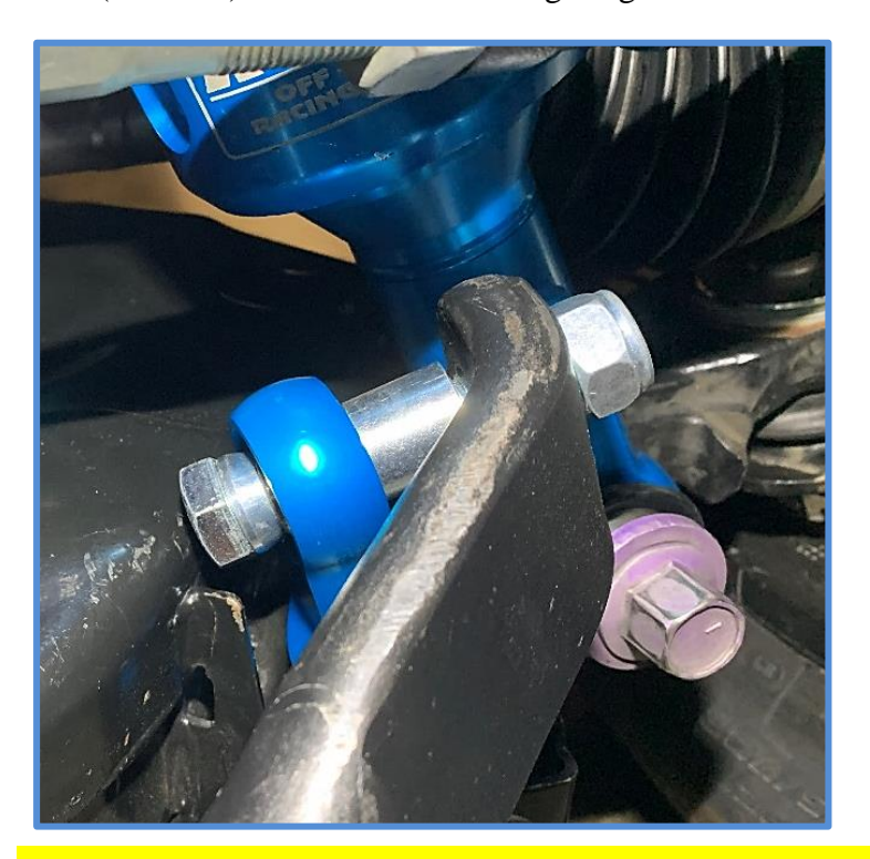
IMPORTANT: Read all instructions thoroughly from start to finish before beginning the install. Check parts list and make sure all parts are included in the kit. If the instructions are not properly followed severe frame, driveline and/or suspension damage may result. Check for frame and suspension damage prior to installation.

6. Install the provided 14mm X 80mm Bolt (CB3836) with washer (CW1805) through the sway bar link and into the sway bar so that the longer spacer is facing the sway bar and the nut will be on the outside of the sway bar. Install a washer and nut (CN3007) and thread nut on finger tight for now.