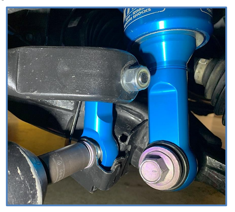
9. Tighten the provided upper bolts to 95ft/lbs.