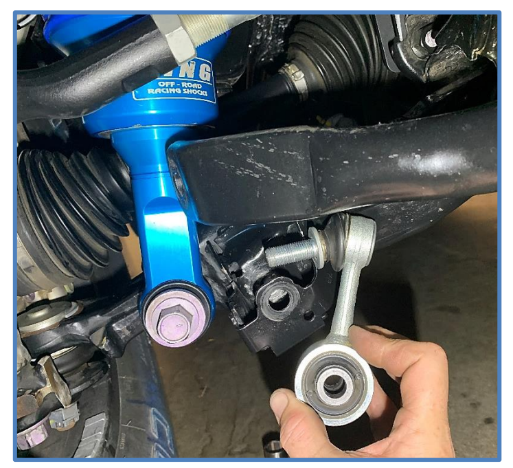
IMPORTANT: Read all instructions thoroughly from start to finish before beginning the install. Check parts list and make sure all parts are included in the kit. If the instructions are not properly followed severe frame, driveline and/or suspension damage may result. Check for frame and suspension damage prior to installation.

3. Remove factory sway bar links from both sides of vehicle.